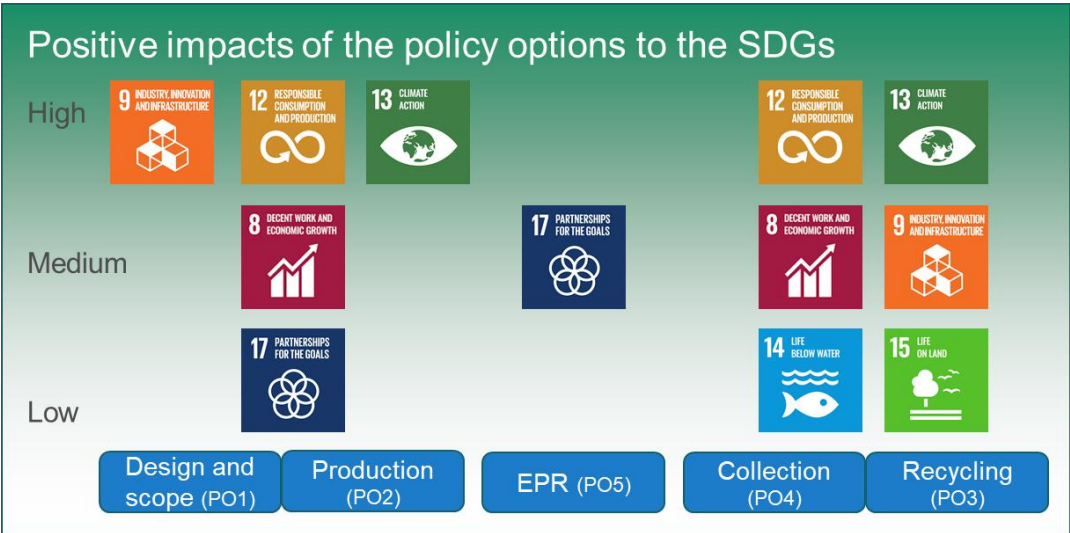
Figure 3 Contribution of the Regulation to the SDGs

Figure 3 visualises the contribution of the policy options to the SDGs. On the left-hand ‘design and production’ side of the diagram, policy options PO1 and PO2 contribute mostly to sustainable innovations (SDG9), responsible consumption and production with a lower environmental footprint (SDG12) and climate action (SDG13). The collection and recycling options PO3 and PO4 contribute to the same SDGs and to less pollution water and air pollution (SDG14 and SDG15) to a lesser extent. PO5 improves partnerships for the goals (SDG17). See Annex 3.3 for more details.